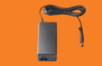
HP 90W Smart AC Adapter Part No: ED495AA