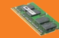
HP Memory DDR2 800 MHz Part No: KT292AA