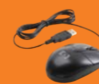
HP USB Optical Travel Mouse Part No: RH304AA