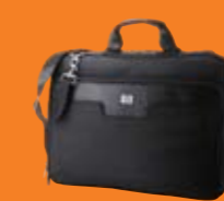
HP Universal Nylon Case Part No: RR315AA