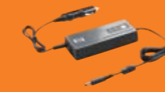
HP 65W Air/Auto/AC Smart Combo Adapter Part No: ED993AA